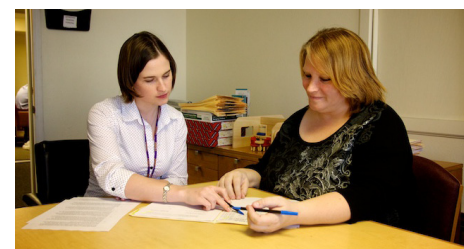
Center for Mental Wellness & Health employees discuss this week's appointments.