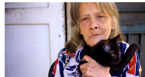
Today, thousands of New Orleans residents are unable to rebuild their homes.